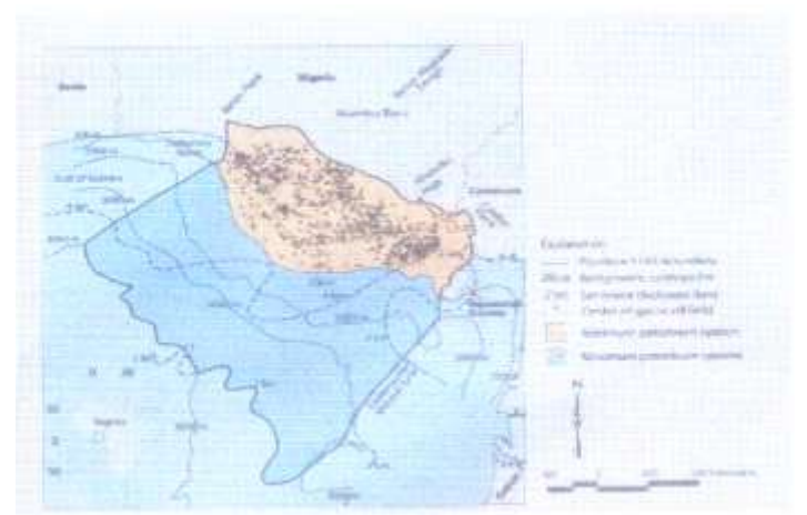
Fig. 1: Index map of Nigeria & Cameroon.

There are some other companies that undertake seismic survey as, for example, China National Petroleum Company, a subsidiary of (BGP) and the 9-month data were obtained from UGNL because the former focused on off-shore seismic activities while UGNL are on-shore based. Fig. 1 shows the index map of Nigeria & Cameroon.