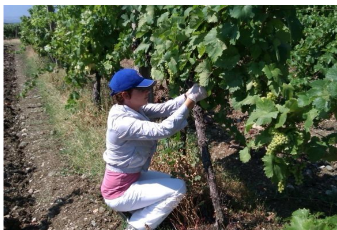
Fig.1. View from the vineyard

or ampeloviruses, suspicious signs were detected compared to the normal condition. The changes included colour, shape, size of the tissue, and so forth. Below we provide pictures from the study site: