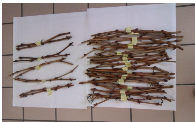
Fig.2. Samples in the laboratory

Samples of vineyards were placed in the plastic bags and brought to the laboratory for the final identification of viral pathogens through the Elisa test.