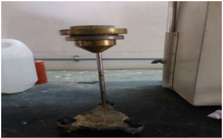
Fig.6 Viscosity cup