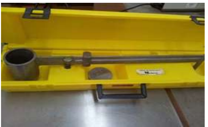
Fig. 8 Mud Balance

To find density of any fluid mud balance can be used keep the scale on the fulcrum with the help of knife edge now fill the cup with fluid and place the lid on it so that extra fluid flow out of the cup move the rider according water bubble so the it comes in center now note the readings of the rider [4].