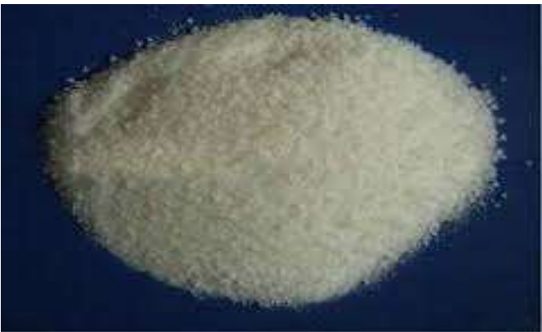
Fig.2 PAM (Polyacrylamide)

PAM is a polymer (-CH<sub>2</sub>CHCONH<sub>2</sub>-) formed from acrylamide subunits. It can be synthesized as a simple linear-chain structure or cross-linked, typically using N.N methylenebisacrylamide. In the cross-linked form, the possibility of the monomer being present is reduced even further. It is highly water-absorbent, forming a soft gel when hydrated, used in such applications as polyacrylamide gel electrophoresis, and can also be called ghost crystals when cross-linked, and in manufacturing soft contact_lenses. In the straight-chain form, it is also used as a thickener and suspending agent [2].