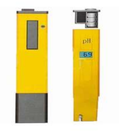
Fig.7 pH meter

pH can be measured by two ways one litmus paper and pH meter.