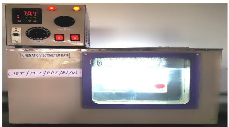
Figure 2.2: Viscometer Bath (Lab Set Up)