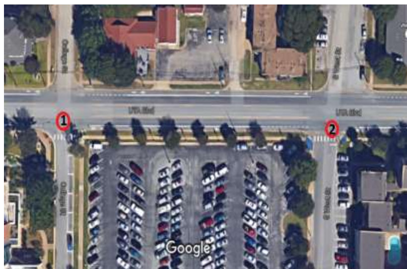
Figure 3: Location 1 (before scenario) and location 2 (after scenario) for the study.

Location 1 is the intersection of UTA Blvd and College Street. This intersection data was collected for the before-re-striping scenario. Location 2 is the intersection of UTA Blvd and S. West Street. This intersection data is collected for the after re-striping scenario. As critical gap also varies with the type of maneuver; only left-turn and right-turn maneuvers are considered in this paper.