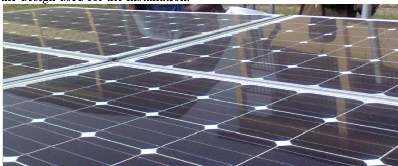
Fig. 1: Monocrystalline panels

Electricity generation from fossil fuels creates greenhouse gas emissions and air pollution. Photovoltaic (PV) systems provide a cleaner, environmentally friendly alternative. They convert solar radiation into electricity and are a great way to reduce environmental impact of our workplace, Nnamdi Azikiwe University, Awka, South East, Nigeria. PV systems allow electricity to be generated in between the two chosen female hostels very close to the source. This helped to avoid the significant energy losses associated with the transmission of electricity over long distances. PV systems are non-polluting, low maintenance and provide a very reliable source of power. They are relatively easy to install and have a long span of approximately 20 years. Fig. 1 shows the 1KVA monocrystalline connected in series to produce 150V used to power our battery bank. The work was basically on the harnessing and utilization of energy from the sun otherwise known as the renewable source of energy. Fig. 2, shows the block diagram of the design used for the installation.