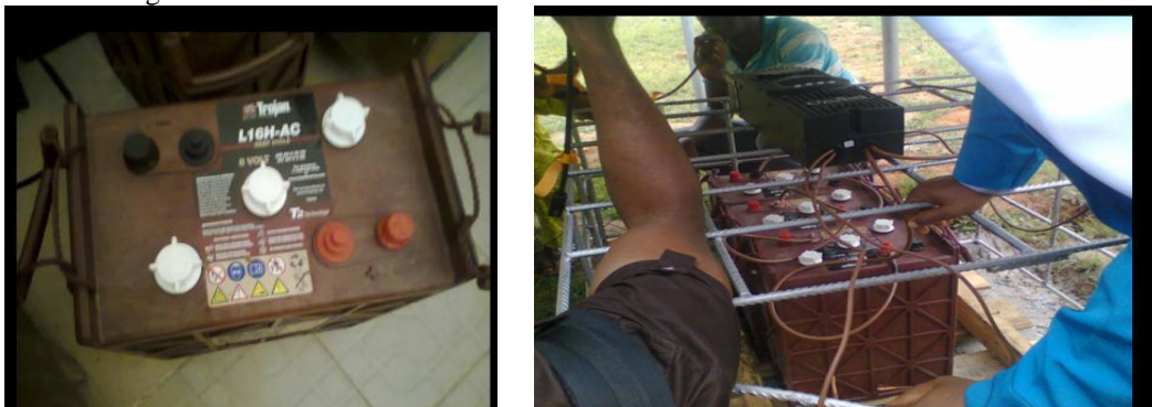
Fig.3: 6V Trojan Battery

We noted the battery sizing which is the capability of a battery system to meet the load demand with no contribution from the photovoltaic system. We chose our battery the 6V Trojan lead-acid with 435Amp-hr so that our stand alone photovoltaic system must maintain a continuous energy supply at night when there is no solar energy as shown in fig. 3.