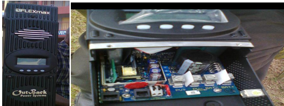
Fig. 4: The MPPT Charge Controller

The MPPT charge controller was used because it operates the PV panels at the voltage that delivers maximum power. That voltage will generally be higher than the voltage required to charge the battery, so the excess voltage is converted into extra current at the voltage demanded by the battery. Therefore, MPPT controllers as shown in Fig.4 not only maximize power extraction from PV panels but also allow tremendous flexibility in PV configuration.