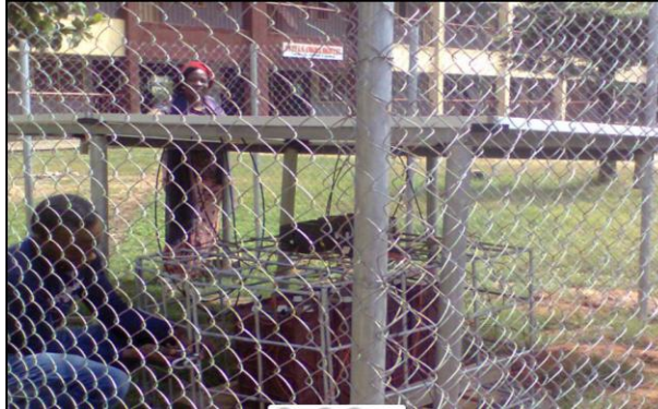
Fig. 5: The Cubicle

wire length. The six different lamp heads were mounted on galvanised pipes located at the farthest measured 88.5m while the nearest measured 20.6m.