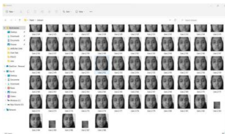
Figure. 2 Capturing multiple images