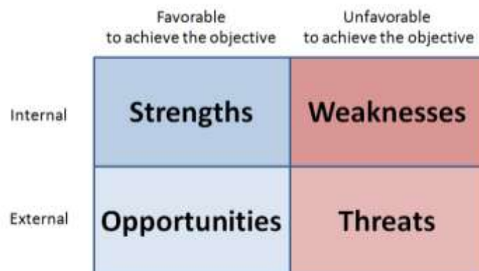
Fig. 1. General scheme of the SWOT tables [17].