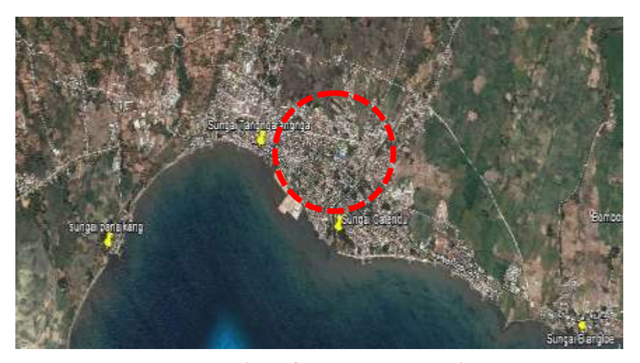
Transportation Infrastructure Integration

The location of this research is in the coastal area of Bantaeng Regency. The actual place is in the Calendu River neighbourhood (Figure 3). The data are obtained from direct observation and interview to the fishermen particularly. The method of analysis uses descriptive qualitative, comparative study with the proper standard and spatial analysis, in addition to planning approach in integrated industrial location concept.