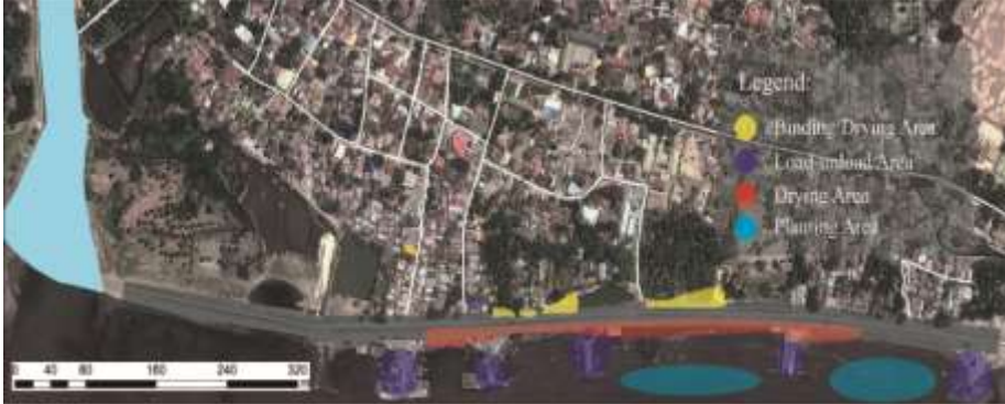
Figure 4. Map of Separated Processing Area

The most of the cases in Bantaeng Regency, the location of housing, drying and planting areas, as well as warehouse are placed separately (Figure 4). This situation is caused by the limitation of land in the housing neighbourhood. Meanwhile, the industrial activities occur under the elevated houses. Hence, there is a distance in processing activities and the distance causes some inefficiencies in the distribution process. Adding to this, fishermen have to move to some different places in binding, drying and planting seaweed with traditional equipment or manual ways. As a result the mobility impacts slow progress and less productivity.